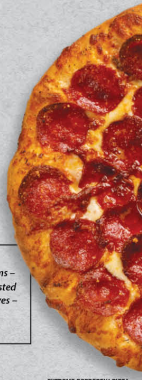
EXTREME PEPPERONI PIZZA

Our 10" Individual Style Pizzas are created from Artisan Dough or Gluten-Free Crust.