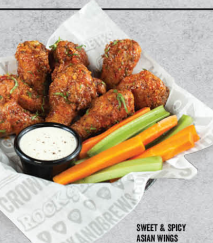
SWEET & SPIKY ASIAN WINGS

Tossed In Fire Sauce – Ranch Dressing – Carrots & Celery 18.99