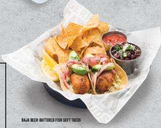
BAJA BEER-BATTERED FISH SOFT TACOS