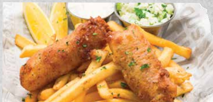
BEER BATTERED FISH & CHIPS