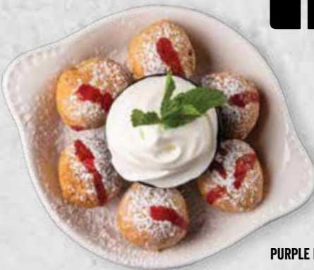
PURPLE RAIN DROPS

★ PURPLE RAIN DROPS Chocolate Filled French Donuts – Drizzled Raspberry Sauce – Whipped Cream 10.95