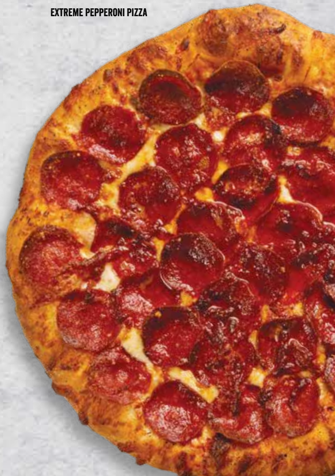
EXTREME PEPPERONI PIZZA

ADD ADDITIONAL TOPPINGS Pepperoni – Italian Sausage – Mushrooms – Jalapeños – Red Onions – Marinated Roasted Peppers – Caramelized Onions – Black Olives – Fresh Pineapple – Roasted Garlic Add 1.95/ea. For Individual Size