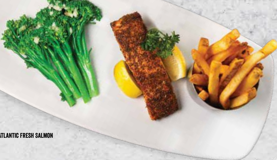
BLACKENED ATLANTIC FRESH SALMON