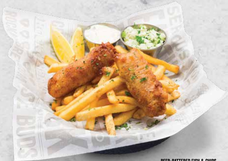
BEER-BATTERED FISH & CHIPS

BLACKENED ATLANTIC FRESH SALMON Cajun Seasoning – Lemon – Natural Fries – Seasonal Vegetables 21.95