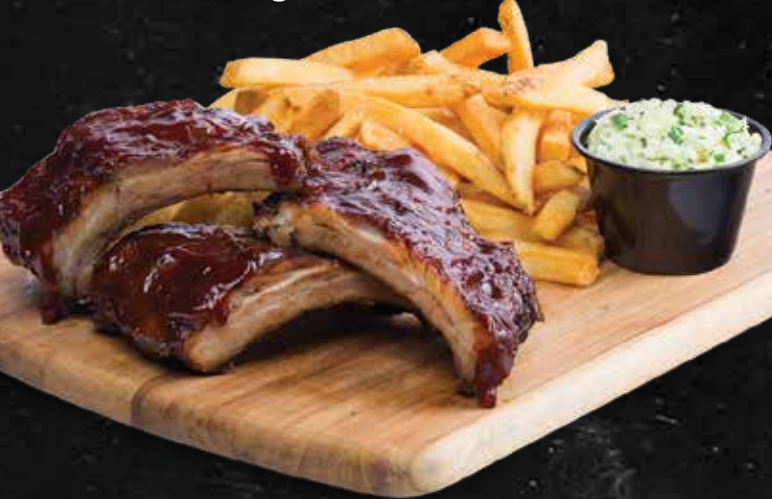
MEMPHIS STYLE BBQ BABY BACK RIBS

★ WE SALUTE YOU - PULLED PORK Brioche Bun – BBQ Sauce – Dill Pickles – Coleslaw 17.95