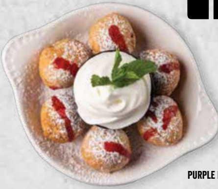
PURPLE RAIN DROPS

★ PURPLE RAIN DROPS Chocolate Filled French Donuts – Drizzled Raspberry Sauce – Whipped Cream 9.95