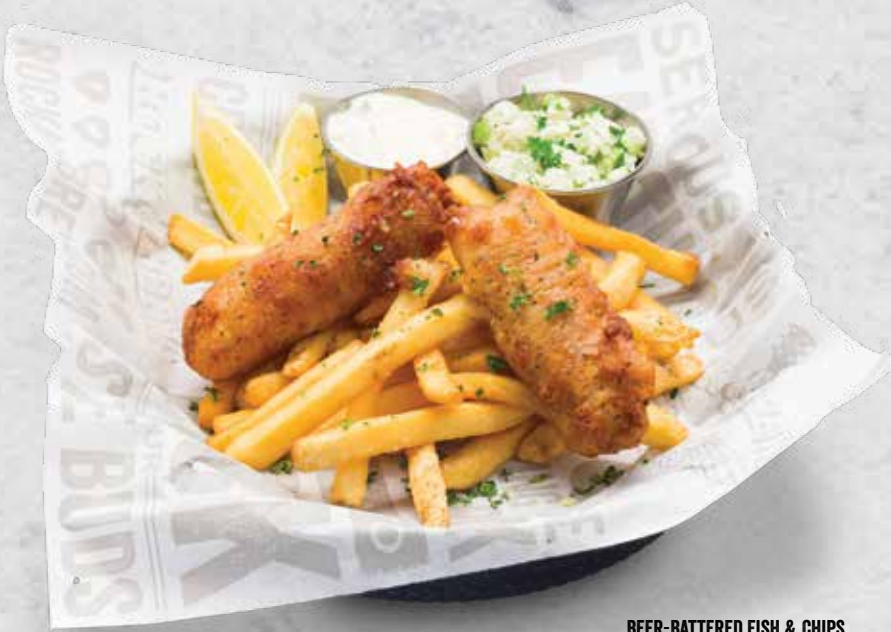
BEER-BATTERED FISH & CHIPS

BLACKENED ATLANTIC FRESH SALMON Cajun Seasoning – Lemon – Natural Fries – Seasonal Vegetables 21.95